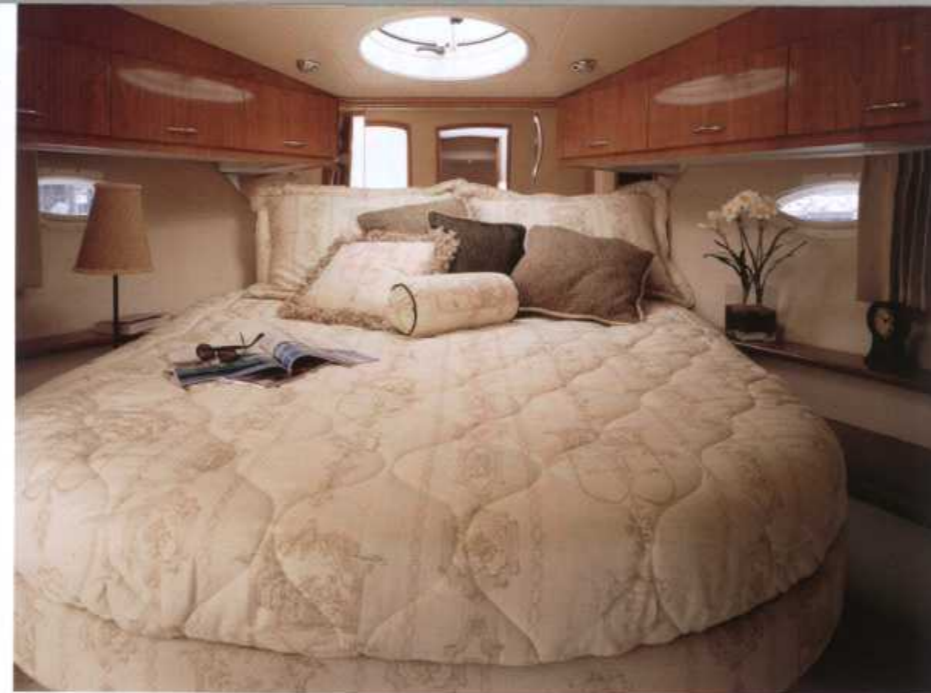
Master stateroom (forward)