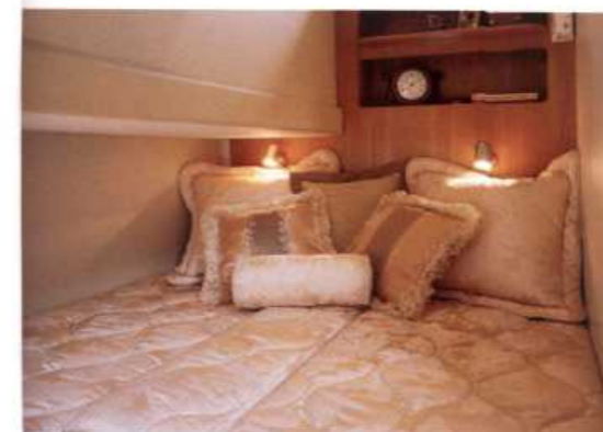
Guest room (midships)