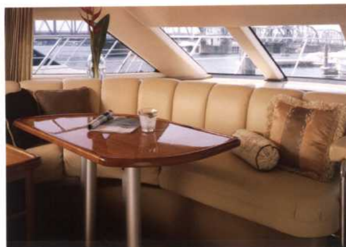
Raised, dinette lounge