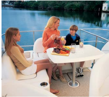
The bridge offers plenty of seating including an aft sofa and portside chair plus a convenient table for games or casual dining.