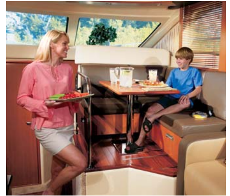
This comfortable dinette features wood flooring, L-shaped convertible seating, folding-leaf table with sliding base, and elegant stainless-steel handrail with tempered glass insert.