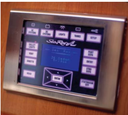
New state-of-the-art electronic power distribution system with 10.4" touch-screen monitor and touch-pad wall switches lets you control a full range of electronic functions from below deck.