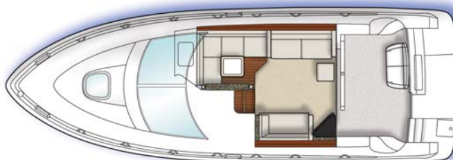
Upper Cabin/Cockpit Layout (Shown w/Optional Aft Bench Seat)