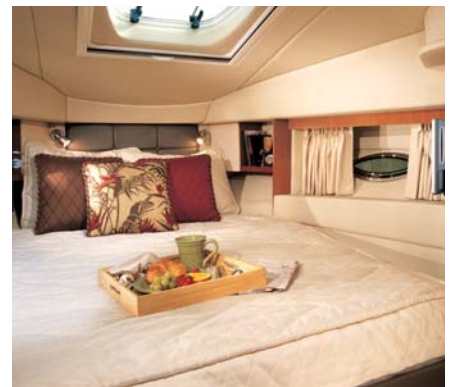
Comfortable forward stateroom features full-size innerspring mattress, pocket sliding privacy door with full-length mirror, hope chest with seating, in-floor storage and 15" flatscreen TV/DVD combo.

Sea Ray Boats, 2600 Sea Ray Blvd., Knoxville, TN 37914. For information call 1-800-SRBOATS or fax 1-636-326-3282. Internet address: http://www.searay.com Note: Not all accessories shown in pictures or described herein are standard equipment or even available as options. Options and features are subject to change without notice. Not all model year boats may contain all the features or meet the specifications described herein. Confirm availability of all accessories and equipment with an authorized Sea Ray dealer prior to purchase. Printed in the U.S.A. June 2006 ©Sea Ray Boats. PUB081806