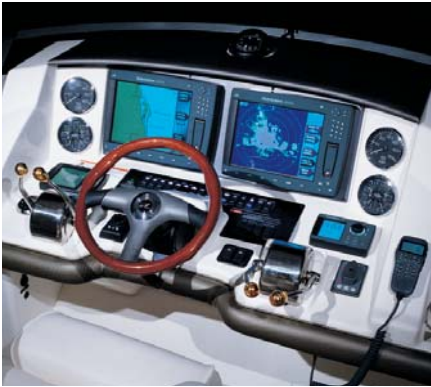
The impressive control station features a full array of electronics including standard SmartCraft™ instruments, Sirius® Satellite Radio and optional Northstar 6000i radar system.

Everything about this beauty is designed with extended voyages in mind, including its outstanding ride and sea-keeping abilities, open and airy cabin, and two well-appointed staterooms. While the captain takes command at the helm, guests will enjoy breathtaking views from the generous bridge seating. In comfort as well as style, the 36 Sedan Bridge will transport you to distant harbors and back again.