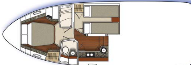
Lower Cabin Layout