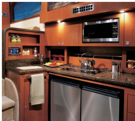
Gourmet galley includes solid-surface countertop, wood flooring, under-counter freezer and refrigerator with stainless-steel fronts, microwave, two-burner stove and built-in coffeemaker.